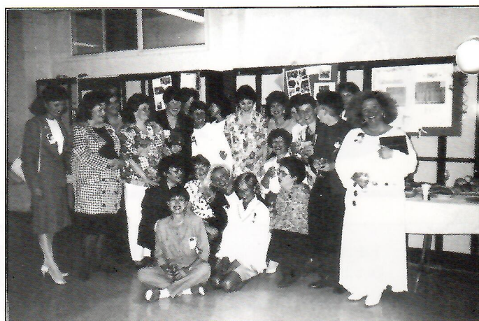
Those gals from '65

"Blessed" as we were, we proceeded to "carry on" – dancing like fools until the management resorted to flicking the lights on and off to hustle us out. I know we would have stayed 'til all hours.