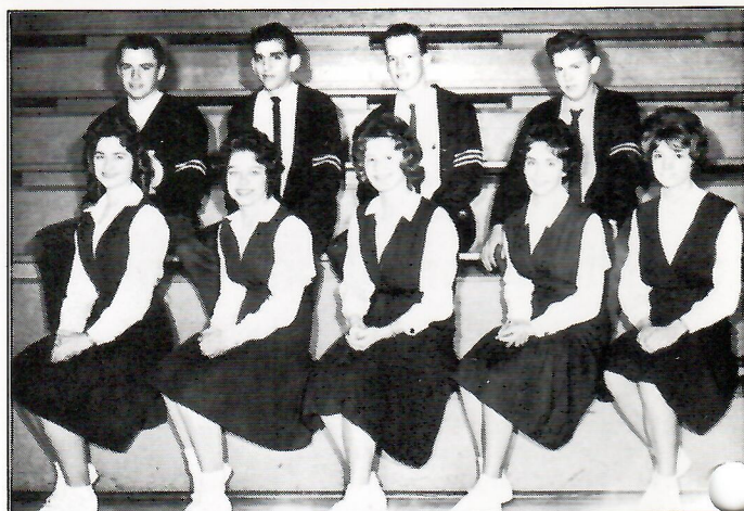
This month, you can guess who is modelling Notre Dame's first uniform.