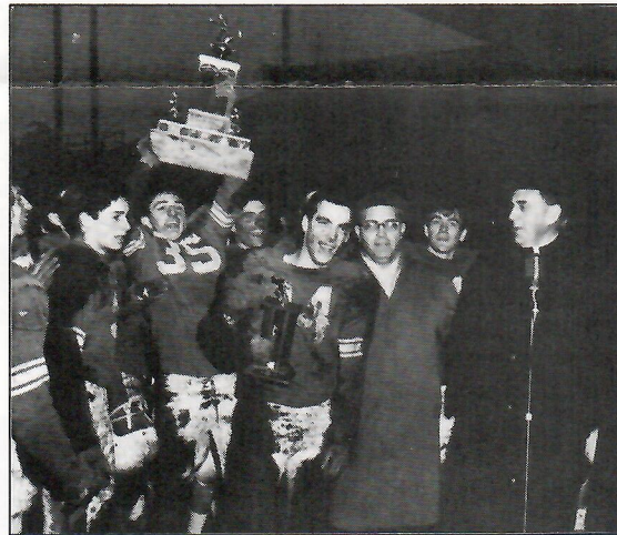
Nov. 11, 1966 – WE DID IT! Notre Dame Wins Archbishop's Trophy for the first time.