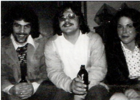
From the early 70's. We'll give you a hint — They are "A Live" group.