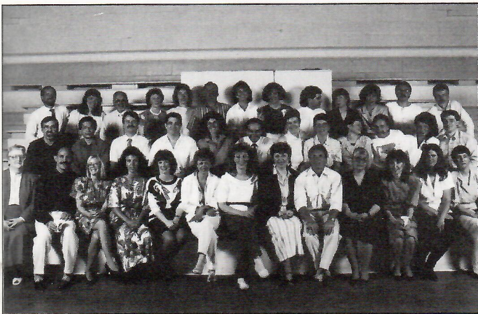
Class of 1969