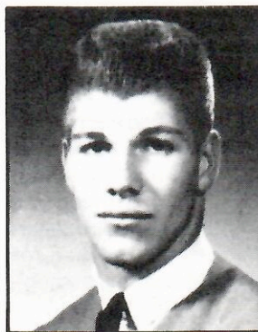
THEN: And he had it trimmed for pictures.