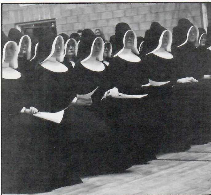
A piece of nostalgia.