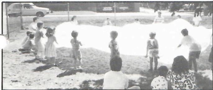
Alumni children enjoying Family Sunday.