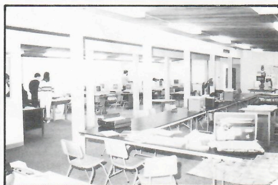
Computer lab - upstairs of old convent.

Going back to N.D. always brings back the old memories, however, this tour made me think how much things have changed, how much they have improved and how old I am getting!