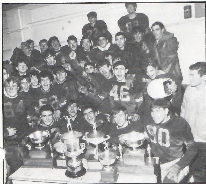
1968 - B.C. Football Champions.