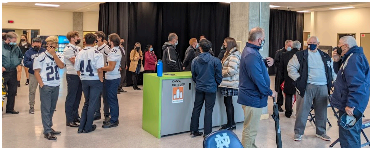
Guest gather in school cafeteria after blessing

Bless the people of this school community and teach them to live together in harmony. We ask your blessing on Juggler Field. Help the Notre Dame community use it for their benefit and recreation.