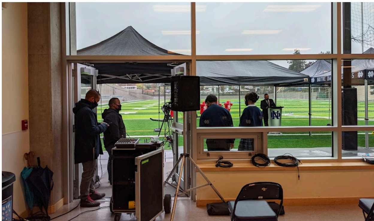
Creative use of canopies and the school kept visitors comfortable during the Juggler Field blessing

and lead us to You through Jesus Christ our Lord.