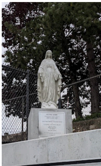
Statue of Our Lady NW corner of Juggler Field