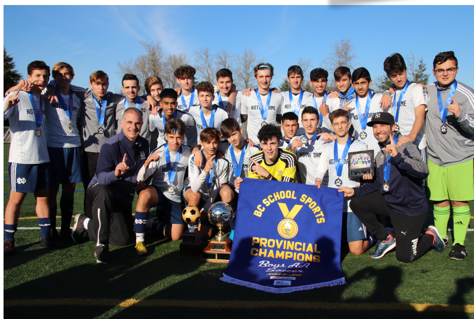
SENIOR BOYS PROVINCIAL SOCCER CHAMPIONS