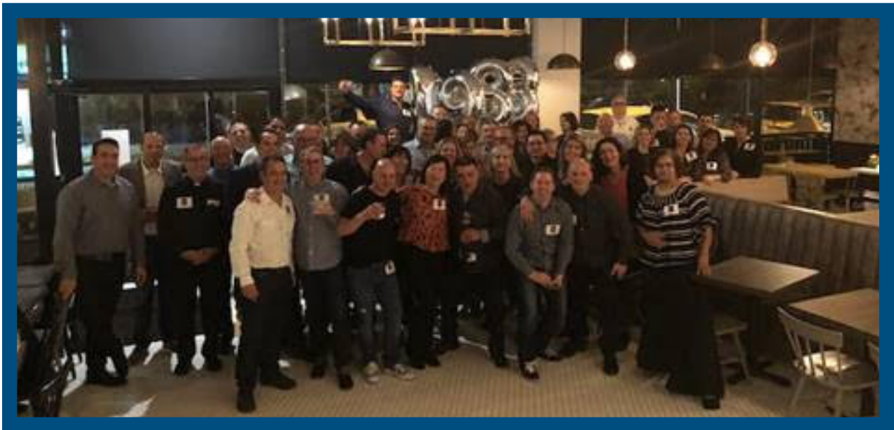
CLASS OF 1988 REUNION

Thirty years later, we got together over delicious food and drinks remembering the friendships we lived for, the great late night parties we had, and the music we played. These memories were shared and lots of catching up was done. We all enjoyed being back together and missed those old ND high school days. It was a great night and