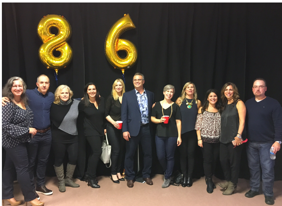
Class of 1986 Reunion