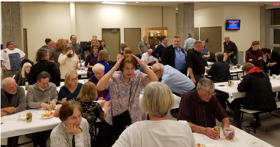
Heads or Tails at Trivia Night!