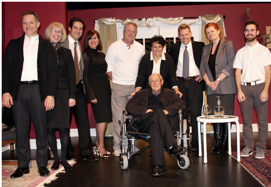
The Cast of Agatha Christie's "An Unexpected Guest"