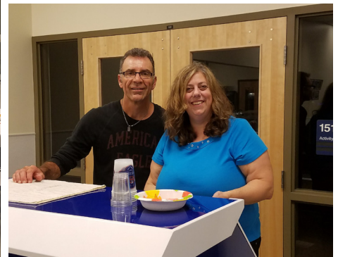
Some of the Trivia Night Crew!