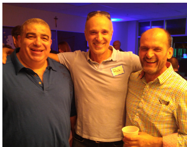
Class of 1976 Reunion