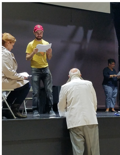
Alumni Play Rehearsal