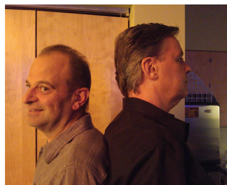
Class of 1976 Reunion

Please come and support the Notre Dame Alumni Association and its performing players! You'll have fun seeing if you can guess "whodunit"!