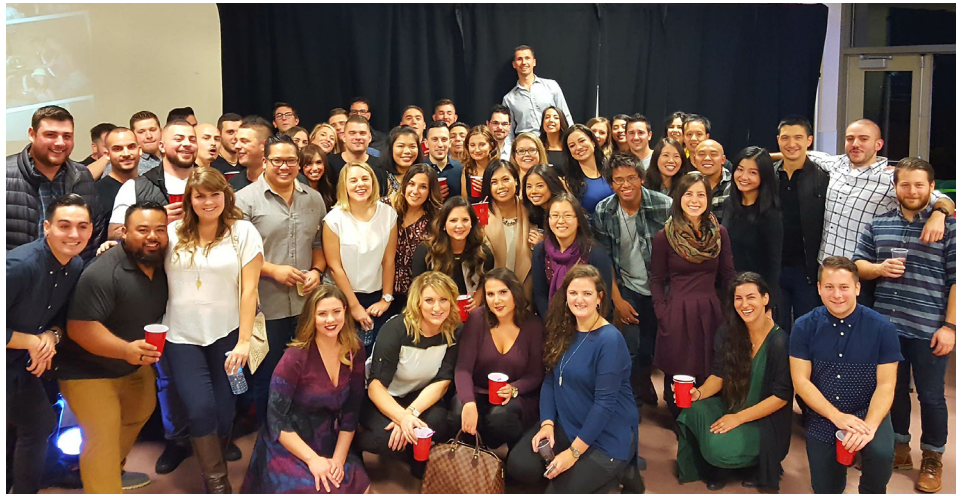
Class of 2006 Reunion