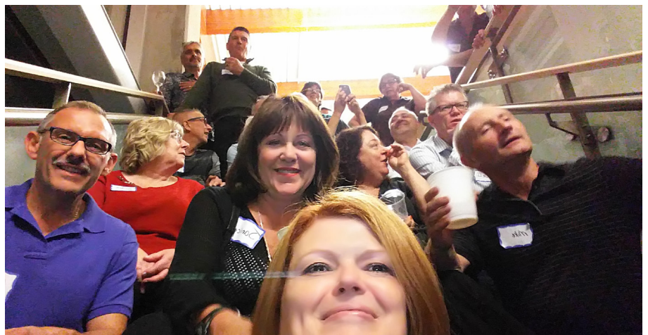
Class of 1976 Reunion

Thank you to the ND Admin for allowing us to host it at the school and to all the organizers!