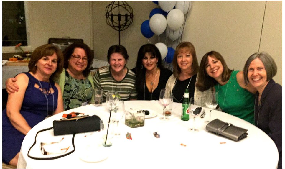
1975 Reunion photos