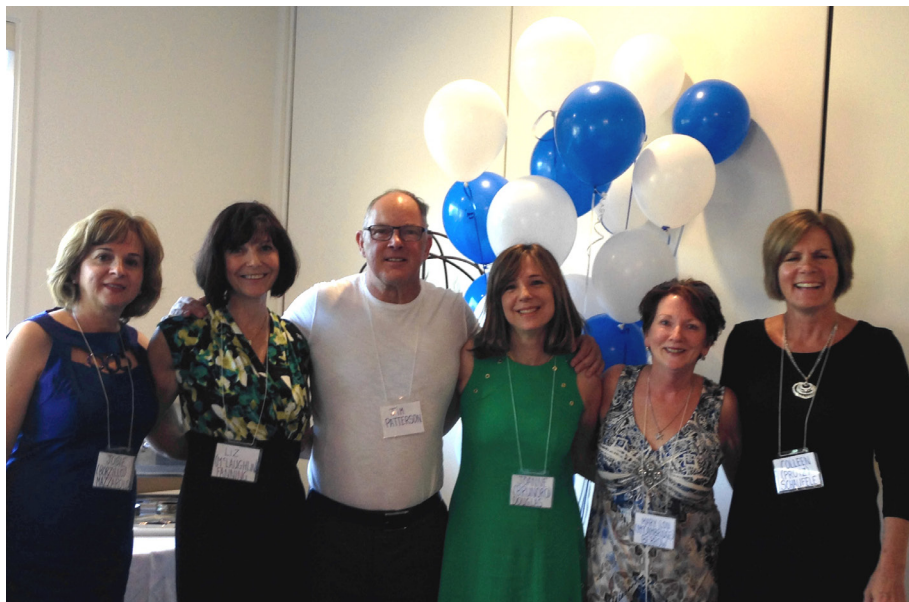
1975 Reunion Organizing Committee