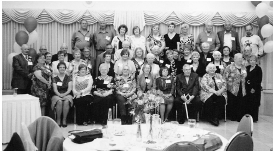
Grads from 1956, 57, 58, 59 and 60 who attended the 50s reunion

The evening was a huge success with lots of time to visit and catch up. For most of us, it was a journey back in time and we were able to pick up where we left off many years ago! As the evening came to a close, the “We should do this again” and “Let’s keep in touch” rang loud and clear! It had been a relaxed and fun evening filled with good conversations, laughter and camaraderie.