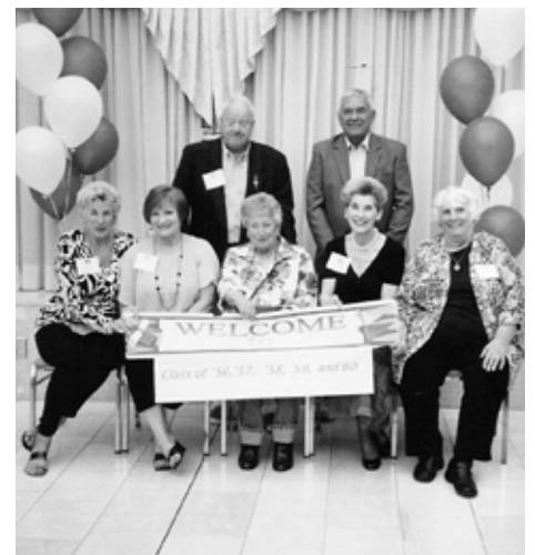
Classmates from 1957