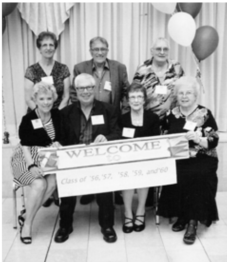
N.D.'s first graduates from 1956

On arrival at the Atrium, attendees were welcomed to a beautifully decorated venue (of course, blue and white). Heard among comments were: “Who’s that?”, “Boy, he still looks great!”, “Lost a bit of hair on top!” “She still looks fabulous!” to “You haven’t changed a bit!” Following a great dinner, there was much fun, banter and laughter as we posed for group photos.