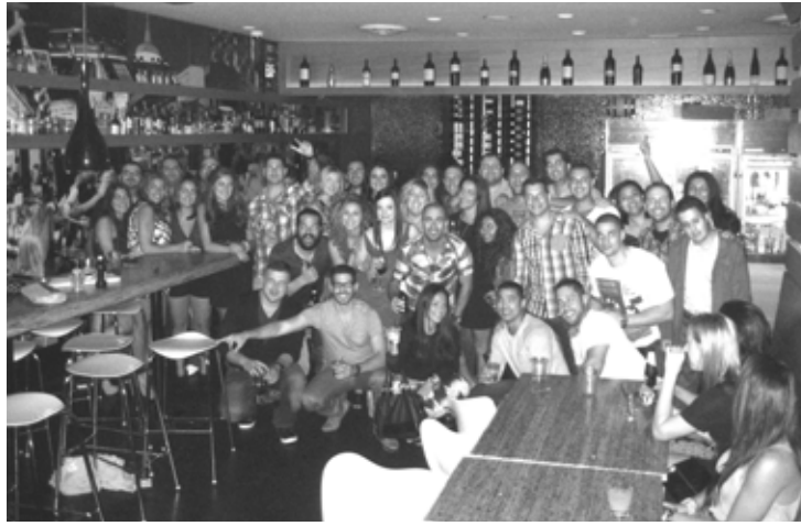
2002 Class Reunion