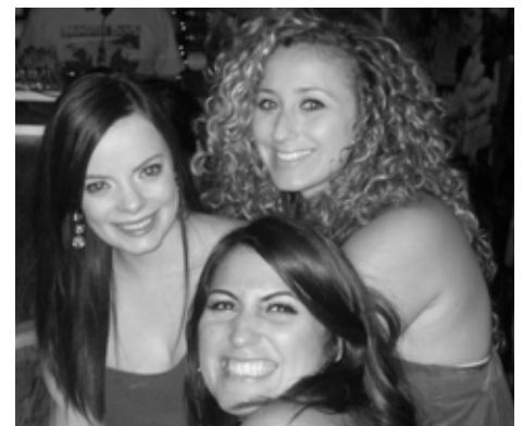
Class of 2002 Reunion