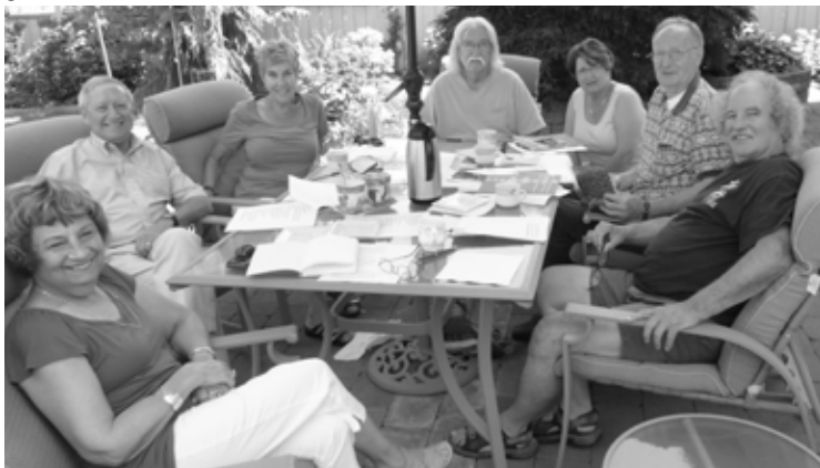
Class of 1961 Reunion Committee.