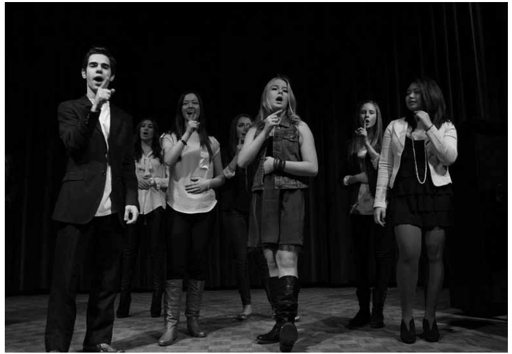
ND Idol 2012

While there are times when activities such as the school Masses and the Advent and Lent Penitential Services occupy the gym, resulting in gym classes being seriously impacted, for the most part, life at Notre Dame does continue to be as activity packed as ever. The fact that we have