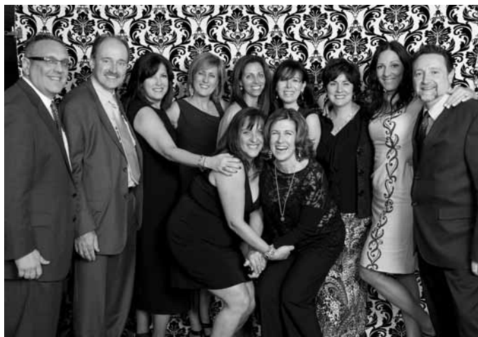
Happy 50th Birthday to the Grad class of '79 who celebrated at this year's gala!