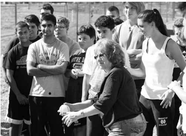
Activity Day September 2011